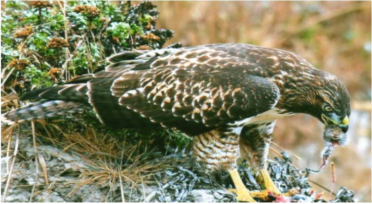
Red Tailed Hawk decapitating a California Meadow Vole. 15 December 2006.