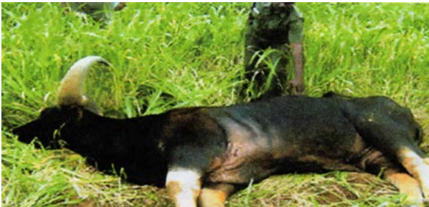
Indian Bison dead of dehydration. 30 September 2009.

Starvation is responsible for the deaths of billions of animals annually. Unlike a predatory attack which can lead to a violent but quick death, death by starvation can drag on for months. During the winter, food is hard to come by. Edible vegetation is often nonexistent or buried beneath snow packs. Many young, weak, and sickly animals cannot endure the lack of food and starve to death. A Michigan Department of Natural Resources study noted, "the number of species diagnosed at the laboratory as dying from malnutrition and starvation are second only to those dying of traumatic injuries." 6 When food is so scarce that billions starve, those that do survive are often chronically hungry and malnourished.