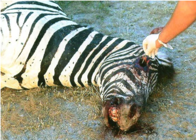
Zebra killed by Bacillus Anthracis Infection. 3 May 2010. Elaine We. Etosha National Park, Namibia.

Parasitologists speak of ectoparasitism when the uninvited guest lives on the surface of its host, and endoparasitism when the parasite dwells within. Among endoparasitic ichneumonids, adult females pierce the host with their ovipositor and deposit eggs within. Usually, the host is not otherwise inconvenienced for the moment, at least until the eggs hatch and the ichneumon larvae begin their grim work of interior excavation.