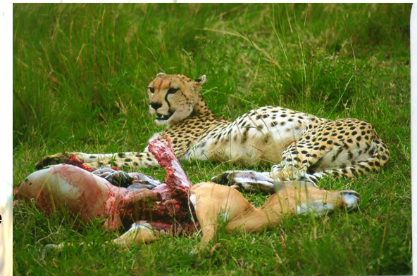
Cheetah with partially eaten impala. After a pursuit that often lasts for over half a mile, the impala is fatally attacked. Marsai Mara National Park, Kenya. 14 July 2007.