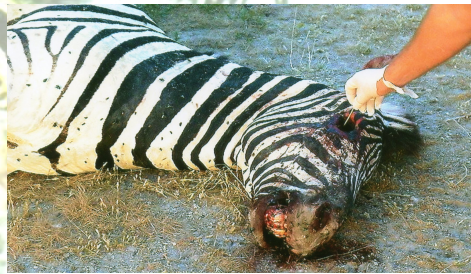
Etosha National Park, Namibia. Zebra killed by Bacillus Anthracis Infection . 3 May 2010.

future destruction secure on its belly. The eggs hatch, the helpless caterpillar twitches, the wasp larvae pierces and begins its grizzly feast. Since a dead and decaying caterpillar will do the wasp larvae no good,...the ichneumon larvae eat fat bodies and digestive organs first, keeping the caterpillar alive by preserving intact the essential heart and central nervous system. Finally, the larvae completes its work and kills its victim, leaving behind the caterpillar's empty shell.” 7