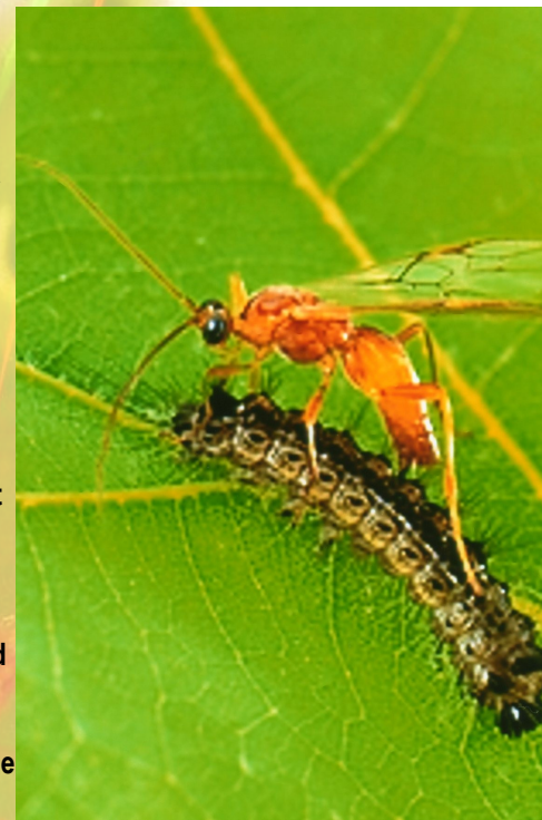
Source: Bauer, Scott. United States Department of Agriculture (USDA). A wasp injecting eggs into a caterpillar. When the eggs hatch, the larvae will eat the caterpillar while it is alive over a period of days. www.ars.usda.gov/is/graphics/photos/k7659.html

“Consider the parasitic relationship between the ichneumon wasp and host caterpillars. The ichneumon are a group of wasps, not flies, that include more species than all the vertebrates combined [hundreds of thousands of species]. The free-flying females locate an appropriate host and then convert it into a food factory for their own young. Parasitologists speak of ectoparasitism when the uninvited guest lives on the surface of its host, and endoparasitism when the parasite dwells within. Among endoparasitic ichneumons, adult females pierce the host with their ovipositor and deposit eggs within. Usually, the host is not otherwise inconvenienced for the moment, at least until the eggs hatch and the ichneumon larvae begin their grim work of interior excavation.