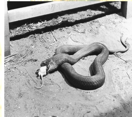
Snake with partially swallowed rat in mouth.

their prey, venomous snakes cause internal bleeding and paralysis over the course of several minutes, and crocodiles drown large animals in their jaws." 6