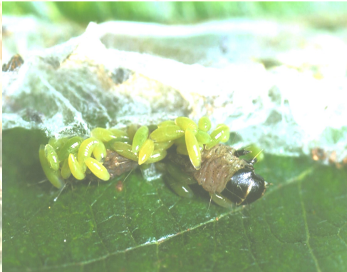
Leafroller Caterpillar parasitized by larvae of Colpoclypeusflorus.

Among ectoparasites, however, many females lay their eggs directly upon the host's body. Since an active host would easily dislodge the eggs, the ichneumon mother often simultaneously injects a toxin that paralyzes the caterpillar or other victim. The paralysis may be permanent, and the caterpillar lies, alive but immobile, with the agent of its