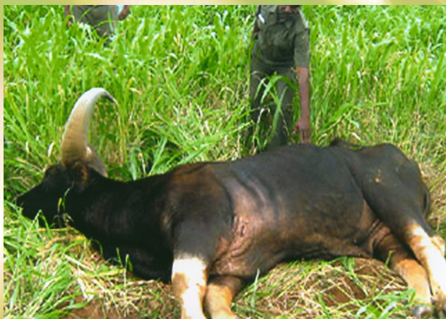
Source: Tamil, Nadu. Indian Bison that has died of dehydration. 30 September 2009.

other species of wildlife have also died in the dry spell which began in January this year.” 9 Droughts and water shortages are not infrequent occurrences. They occur in most habitable locations leaving animals in a panic as they search for sources of water.