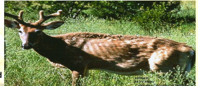
An emaciated deer with rib cage visible. Deer that are emaciated during the summer, a time when food is more readily available, will usually succumb to starvation during the food-scarce winter months.

Starvation is responsible for the deaths of billions of animals annually. Unlike a predatory attack which can lead to a violent but quick death, death by starvation can drag on for months.